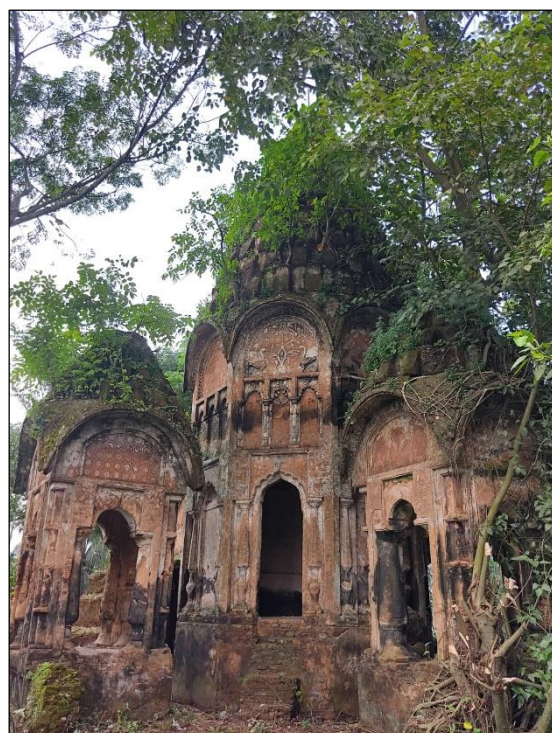
Fig 03: Aranyapur Pancharatna Temple