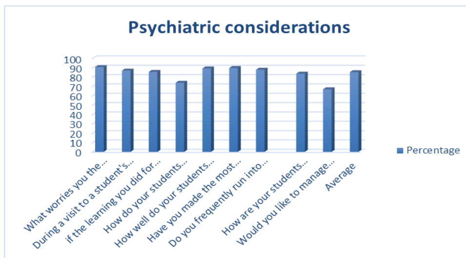
Figure 2. Chart Psychiatric considerations