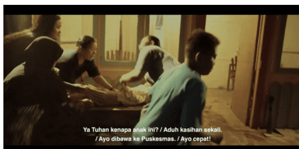
Figure 1. The women (mothers) help Sawiyah to go to the health center (Puskesmas) Timecode 18:23:00

Karen J. Warren (2000) proposes an ecofeminist ethic that emphasizes the interconnectedness of all forms of life and advocates for an ethic of care, which seeks to nurture and protect both the environment and marginalized communities. In Encret (2019) the consequences of environmental degradation and patriarchal systems on Sawiyah and the community in Jember illustrate the interconnected nature of these issues. The film encourages viewers to recognize the importance of an ethic of care as a means to challenge the dominant power structures that perpetuate environmental exploitation and gender inequality.