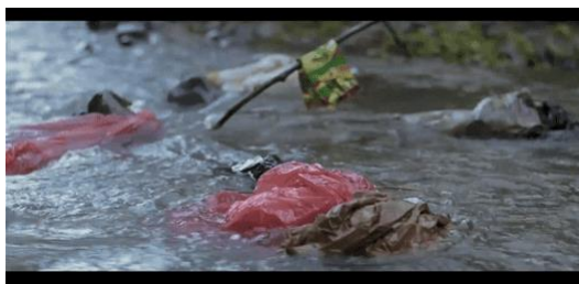
Figure 3. Polluted River Timecode 08:29:00

Every single element that appears within the frame contributes to the overall effect of the image, and directors select, arrange, and coordinate these elements in order to create an expressive whole (Bordwell, 2013) like Sawiyah's suffering throughout the film serves as a potent symbol of the consequences of environmental exploitation. As her health deteriorates, Sawiyah's struggle highlights the immediate and long-term effects of environmental degradation on human health, including the spread of disease, increased mortality rates, and diminished quality of life. Her tragic fate serves as a cautionary tale, warning of the dire consequences