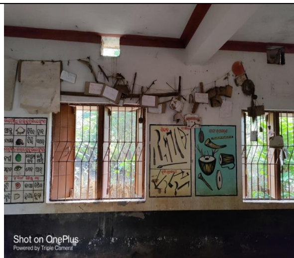
Culturally painted classroom