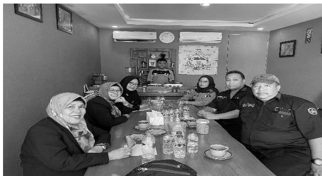
Figure 3. Cafe at Nusakambangan

Third, the development of community empowerment programs. Community empowerment programs involving ex-convicts can help reduce stigma. According to Goffman, stigma can be reduced when stigmatized individuals successfully demonstrate that they are able to meet social expectations. Programs such as job skills training, social activities together, and participation in community projects can help ex-convicts rebuild their identity in the eyes of society. As shown in the picture below, where a Nusakambangan inmate with the initials F becomes a barista, who in the next few months will come out with skills like the outside community.