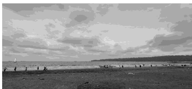
Figure 2. Teluk Penyau

This geographical proximity is very relevant in the context of public relations management between correctional institutions in Nusakambangan and local communities in Cilacap, including the community around Teluk Penyau Beach. Local communities often have certain perceptions and attitudes towards the existence of correctional institutions close to where they live. For example, there may be concerns about security or social stigma against inmates and ex-convicts. The relatively close distance of about 15 minutes from the beach can be seen from the picture below.