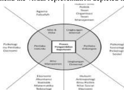
Image of decision making process

When making a decision, it is important to take into account various factors, including the internal environment, group dynamics, external environment, knowledge management, individual dynamics, values, and beliefs, which may encompass religion and world view 19 . In order to comprehend the visual representation depicted in the subsequent image: