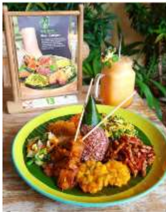
Figure 1. Recommended vegetarian food in Earth Café