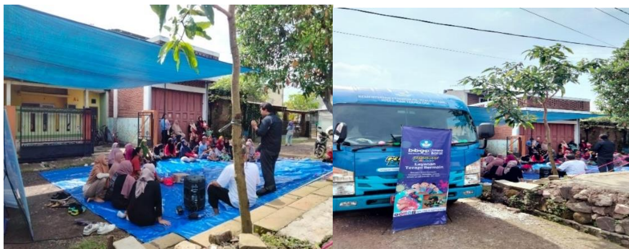
Picture 8a and 8b. Psychosocial support for adults who have suffered trauma at Cianjur West of Java (BBGP)