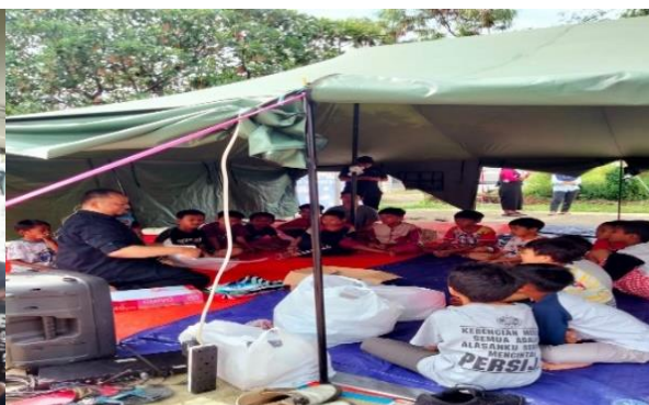
Picture 4. Second Gathering

The following are the stages of implementing activities: