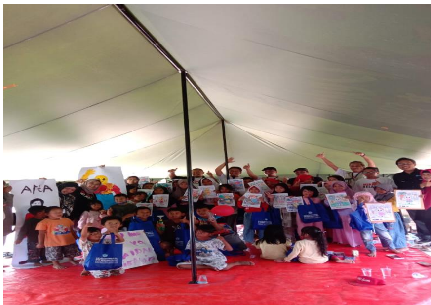
Picture 7. Joyful Learning