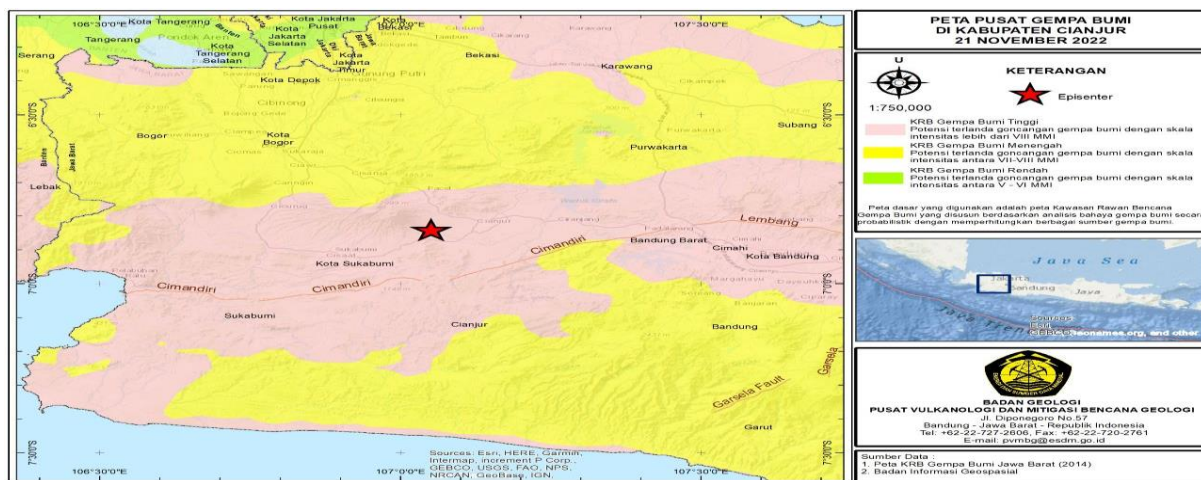
Figure 2: Map of the center of the Earthquake in Cianjur Regency, 11/21/2022(PVMBG - Badan Geologi 2022)

These Quaternary sediments are often soft, loose, and not yet compacted (unconsolidated), rendering them prone to earthquakes. Aside from that, the morphology of wavy to steep hills made up of weathered rocks has the ability to cause ground movements that can be initiated by large earthquake shocks and heavy rains. This earthquake was caused by active fault activity, according to data from BMKG and GFZ Germany on the location of the earthquake's epicenter, depth, and source mechanism. This active fault's characteristics are still unknown.