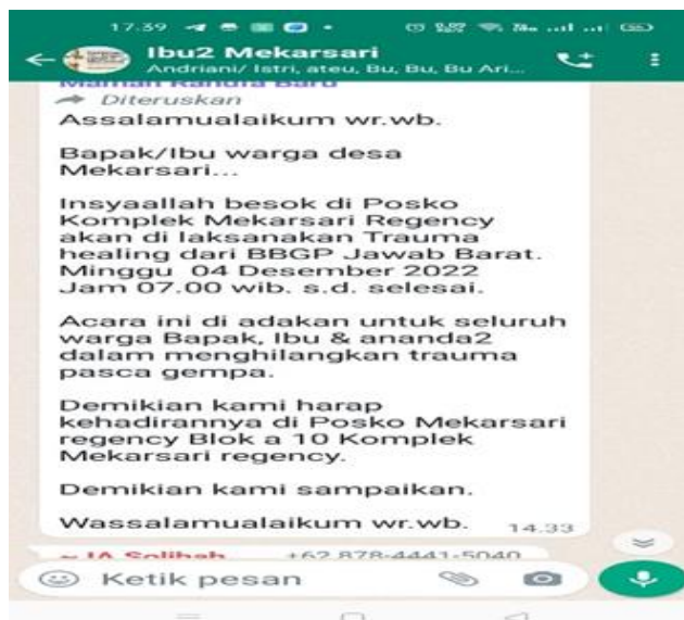
Figure 5. Invitation to attend the psychosocial support event via Whatsapp Group Mekarsari regency.