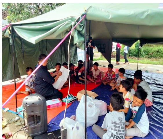
Picture 6. Quirky Learning