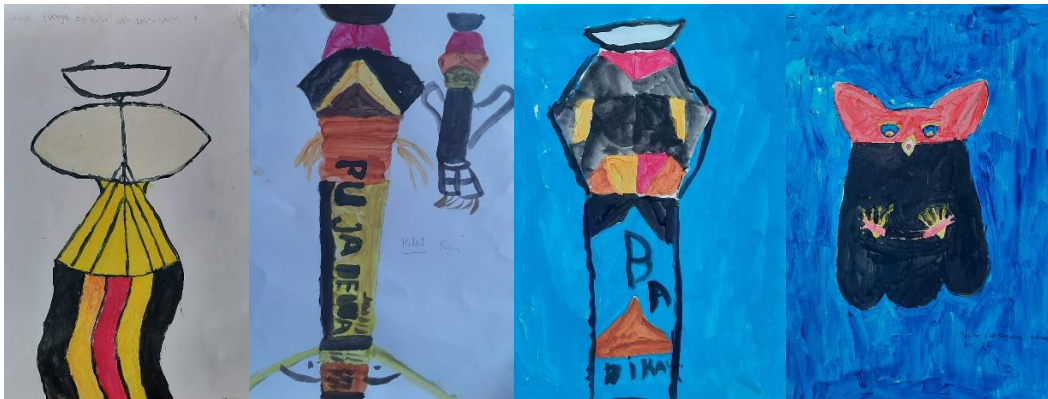
Photo No. 11. A kite with white, yellow, red, and black. Photo No. 12. Kites with text “Puja Dewa.” Photo No. 13. A kite with a blue tail. Photo No. 14. A kite in form of an owl image.