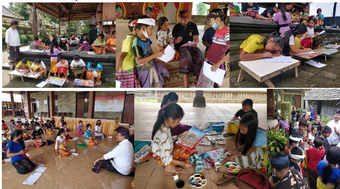
Photo No. 1. Researcher observing children's painting. Photo No. 2. Interviews with children about colors. Photo No. 3. Children paint. Photo No. 4. Questions and answers about the experience. Photo No. 5. creative processes. Photo No. 6. discussion and aesthetic response.