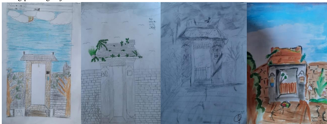
Photo No. 7. Painting of the entrance using a ruler to make straight lines. Photo No. 8. The object of holding hands when making direct observations. Photo No. 9. The entrance is expressed freely by paying attention to the light and dark in the lighting. Photo No. 10. The entrance is expressed with free and expressive coloring.

The results of their work show that freedom, sensitivity, and inspiration from the natural environment shape children's character. The sample in this study is a painting of entrance-entrance made in several stages. In the first stage, before there were instructions from the instructor, they painted straight lines using a tool, a ruler. The goal is to get straight, firm, and clear lines from the shape of the painted angular walls. Then secondly, after observing the entrance-entrance object they changed their vision from straight lines to artistic lines based on observations of the objects being painted. Likewise, the details of objects attached to the object are made with care, including when a bird perches on the roof of the entrance and becomes the object of their painting. Third, their line expressions are very spontaneous, understanding of light and shadow begins to appear with more expressive lines and a stronger understanding of composition and balance. Lastly, when children paint using color, they show freedom not only in color processing but also in expression and form processing that is more spontaneous and dynamic. The entrance of Penglipuran is the pride of the children in choosing painting objects.