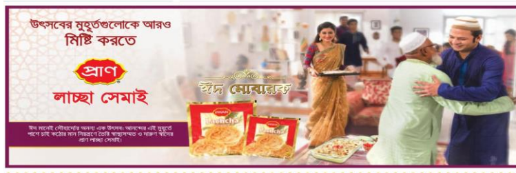
Figure 5: Sample 5