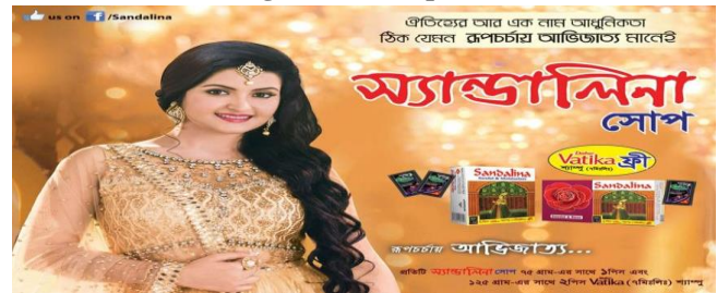
Figure 11: Sample 11