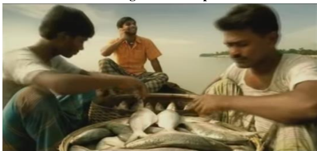
Figure 15: Sample 15