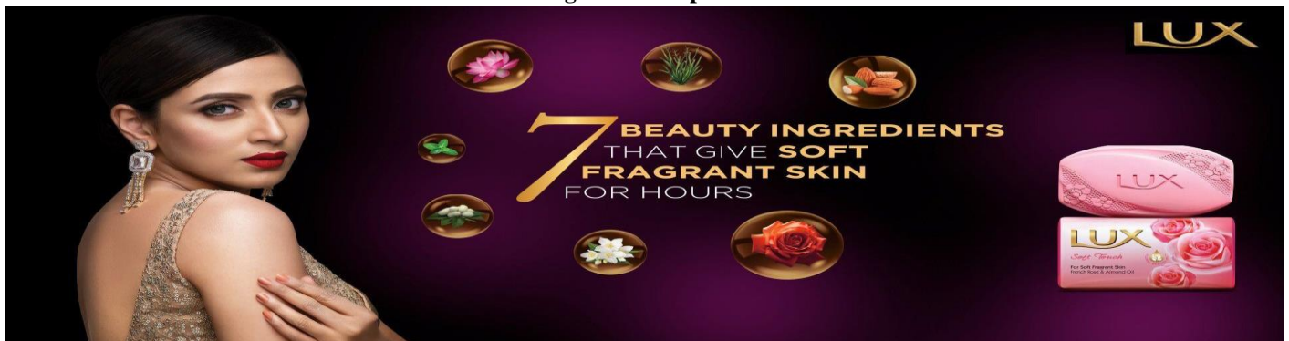
Figure 8: Sample 8