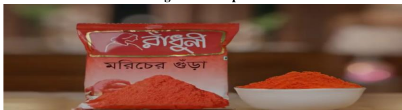
Figure 3: Sample 3