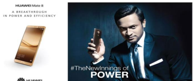
Figure 14: Sample 14