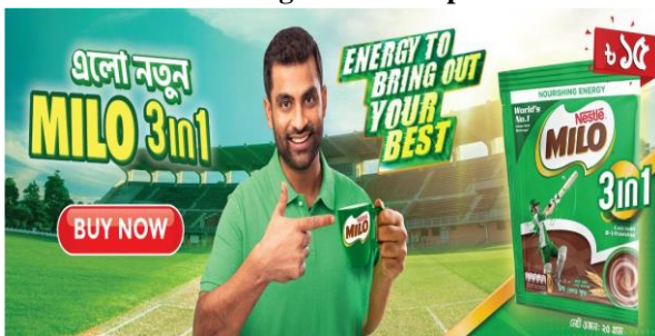
Figure 13: Sample 13