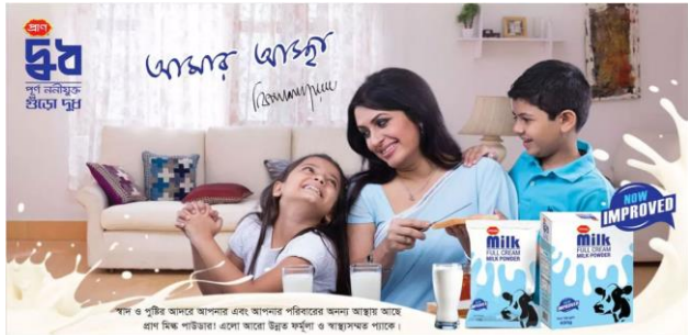
Figure 6: Sample 6