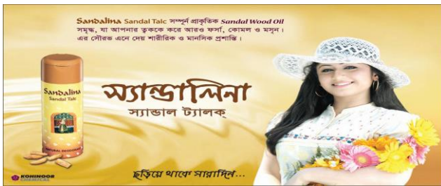
Figure 10: Sample 10