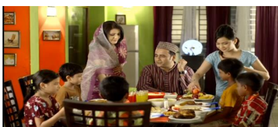
Figure 4: Sample 4