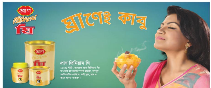
Figure 7: Sample 7