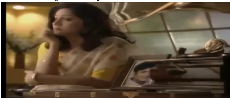
Figure 2: Sample 2

(Source: Selected sample from Google Image)