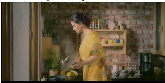
Figure 1: Sample 1