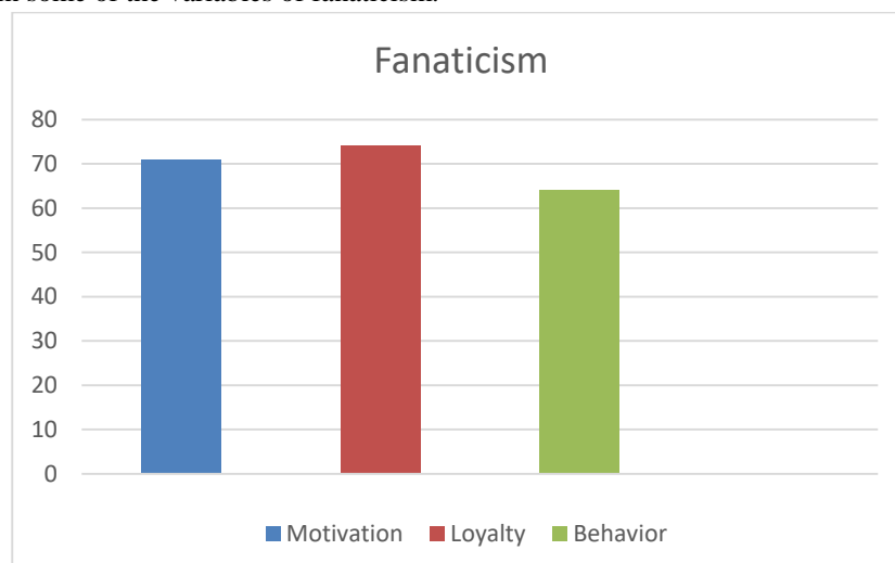
Figure 2. Variable Fanaticism

The researcher will explain some of the variables of fanaticism.