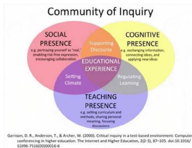
Community of inquiry model (Garrison et al., 1999).

According to Dewey, in education the questioning process is a process of investigating a problem and the issues that arise, not just remembering the solutions obtained. The process of asking questions in an educational community focuses on learning goals and outcomes. This process is a systematic process for defining relevant questions, conducting investigations for pertinent information, seeking alternative solutions and implementing these solutions. A successful Community of Inquiry depends on purposeful and respectful relationships that encourage both faculty and students to be free to express opinions so that open communication occurs