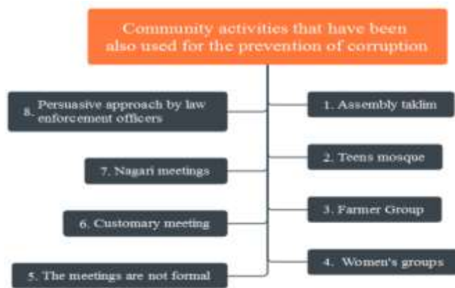
Fig. 4 Community activities that have been also used for the prevention of corruption

Legal communication is done in a direct way to the community through the activities undertaken in the group of these communities. Legal communication contains the delivery of information information about the law to the community directly. Submission is done to the group of community activities, and some are done directly to the individual. Submission of information is done through casual chat with the community. Legal communication is also done at informal meetings of the community such as in a warung stalls, resting place in the middle of work and others as