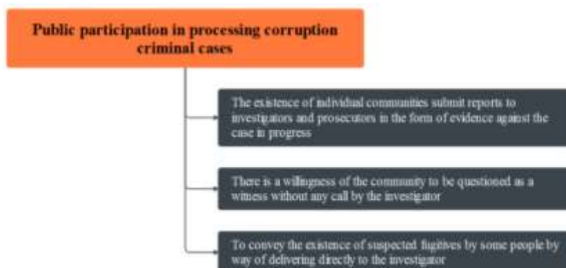
Fig. 3 Public participation in processing corruption criminal cases

In addition to the form of community participation to crack down on corruption there is also a form of public participation in processing corruption criminal cases, among others: