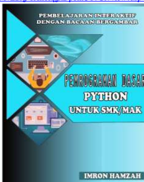
Image 2. Student's Module Footage

https://drive.google.com/file/d/1tDPnOnzXMvL2sg-8XfrHqgxDP6mUT7G9/view?usp=sharing