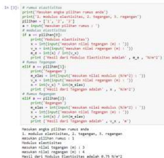
Image 4. Example of Python's modest program

The results of the study were presented in the form of the presentation of validation data obtained from three experts, namely (1) design experts, (2) experts of content / material, and (3) media experts.