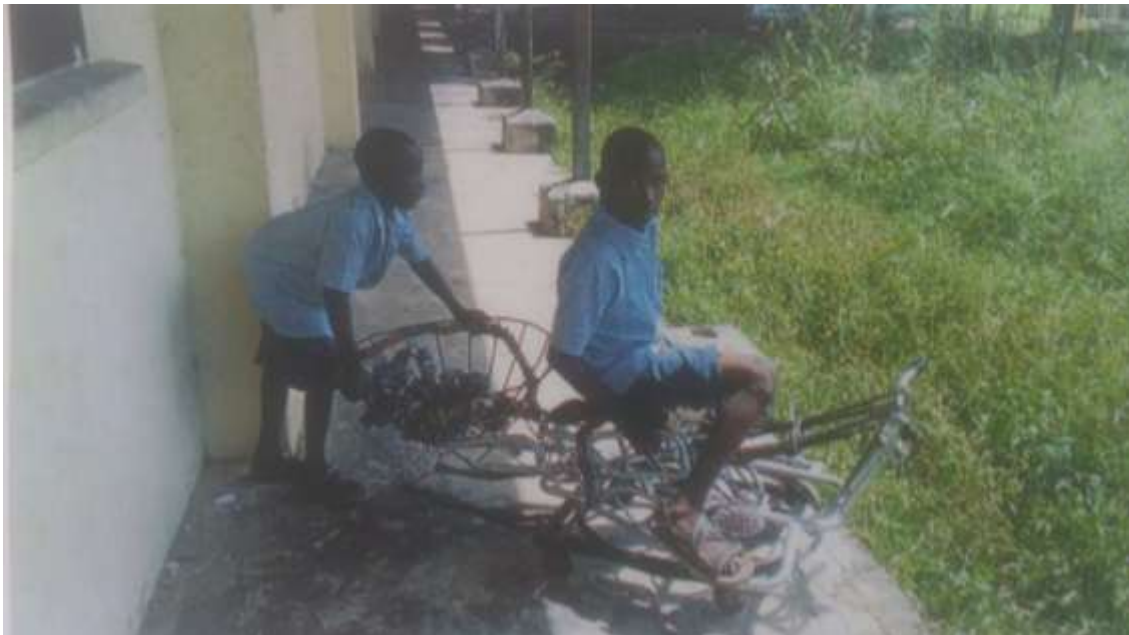
Figure12: Children from Abraka model primary school playing with play sculpture model 7, Photograph: Okogwu Antonia, 2016