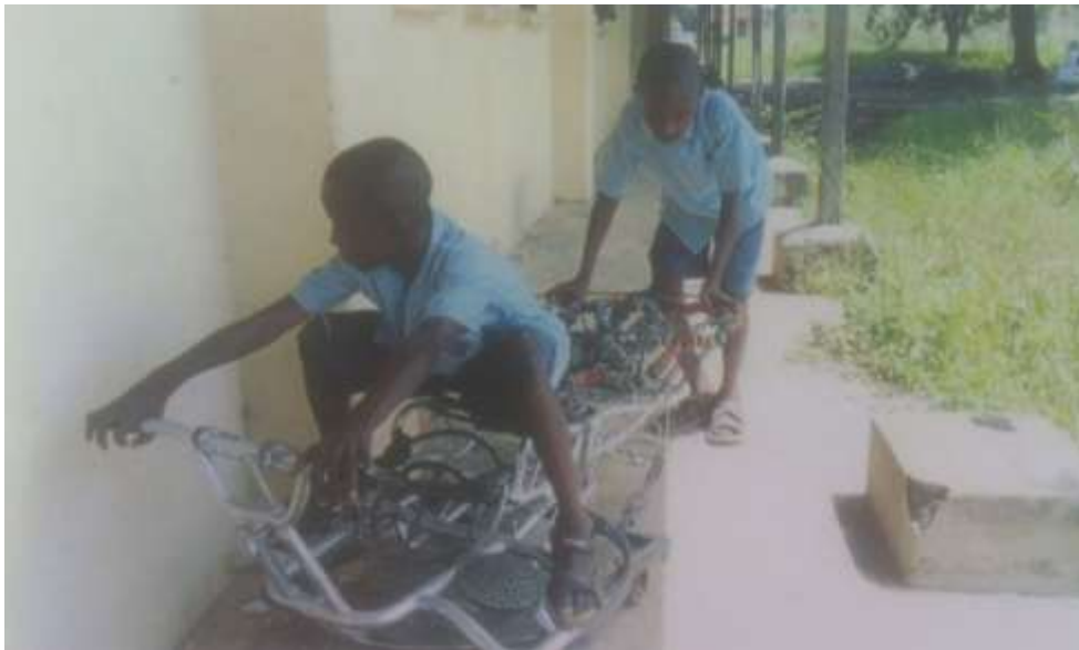
Figure 11: Children from Abraka model primary school playing with play sculpture model 6, 2016