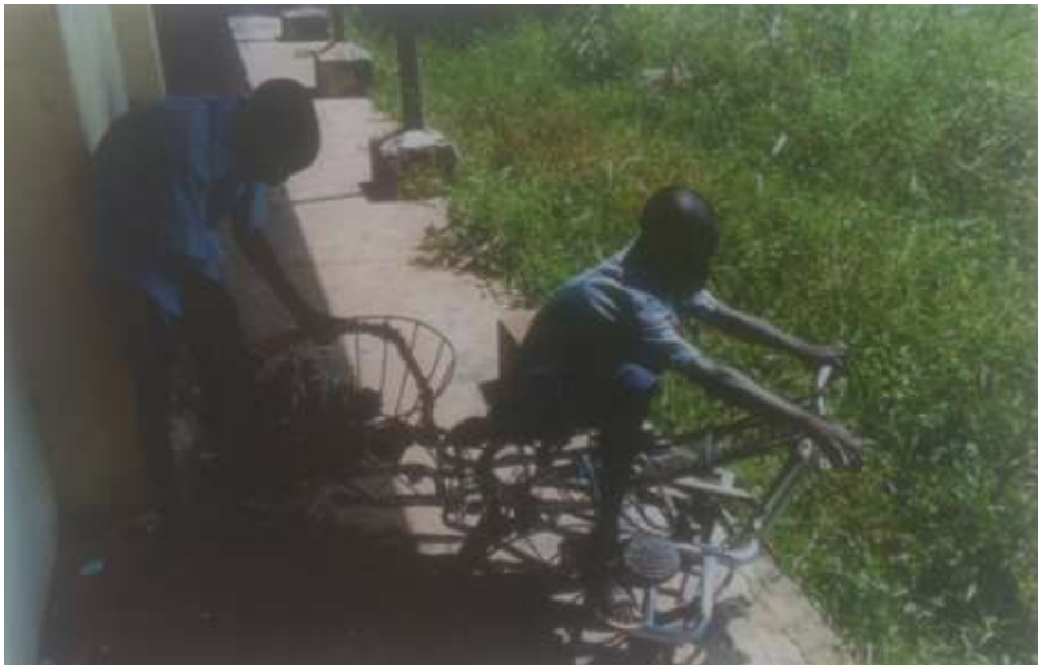
Figure8: Children from Abraka Model Primary School Playing with play sculpture model 3, 2016