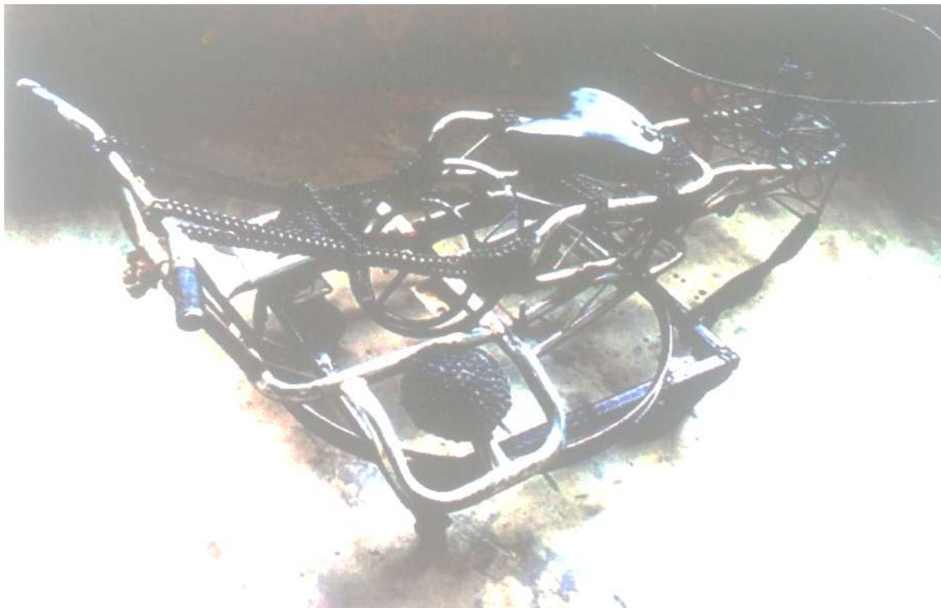
Figure 5: Play Sculpture Model 2, bicycle, chains, seat and wheel, metal rings, chrome motor cycle fenders, metal basket and angle bar. 53.34cm x 147.32cm (1ft.9ins x 4ft.10ins), 2011.