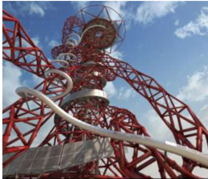
Figure 2: The Arcelormittal Orbit Descender, Queen Elizabeth Olympic Park, 2019, courtesy: olympicpark.co.uk .Lois and Richard Rosenthal Center for Contemporary Art Zaha Hadid Architects