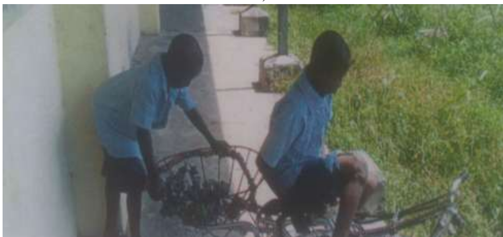
Figure 13: Children from Abraka model primary school playing with play sculpture model 8