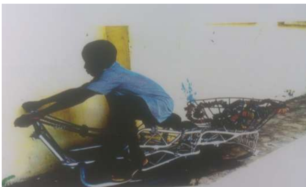
Figure 7: Children from Abraka Model Primary School playing with play sculpture model 2, 2016, Photograph: Okogwu Antonia