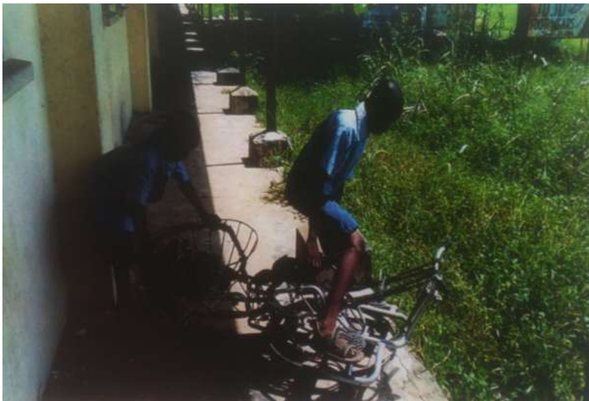
Figure 6: Children from Abraka Model Primary School Playing with play sculpture model, 1, 2016, Photograph: Okogwu Antonia

This play model was purposely placed in places where people could interact with and it turned out that both adults and children rode on it.