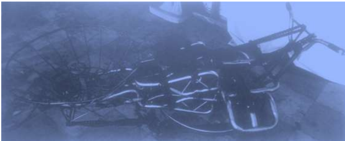
Figure4: play sculpture model, metal, plastics, 2014, Photograph: Okogwu Antonia, 2014

Spraying the form with only two colours of black and silver and attaching some stringed dices flip-flops to catch the attention of the children owing to their colourful nature.