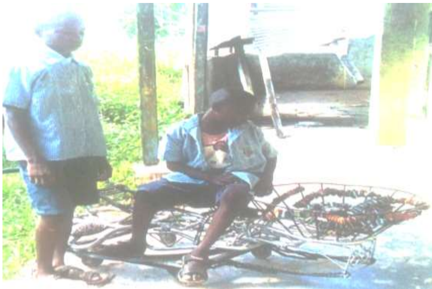
Figure 9: Children from Abraka model primary school playing with play sculpture model 4, 2016