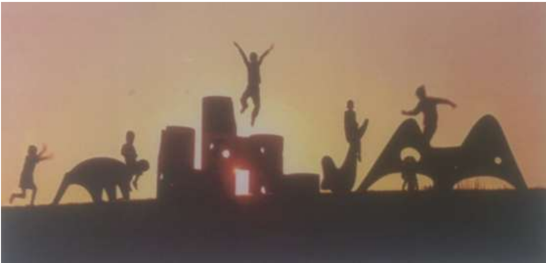
Figure 1: Sculpture and Play illustrated