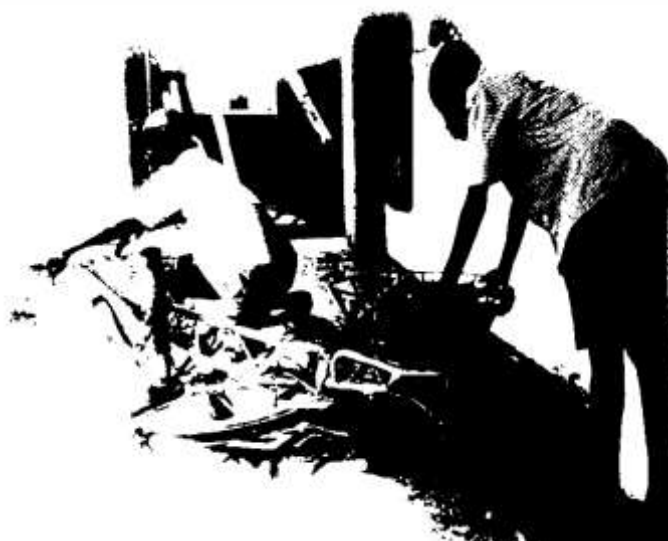
Figure 10: Children from Abraka Model Primary School Playing with Sculpture model 5, 2016