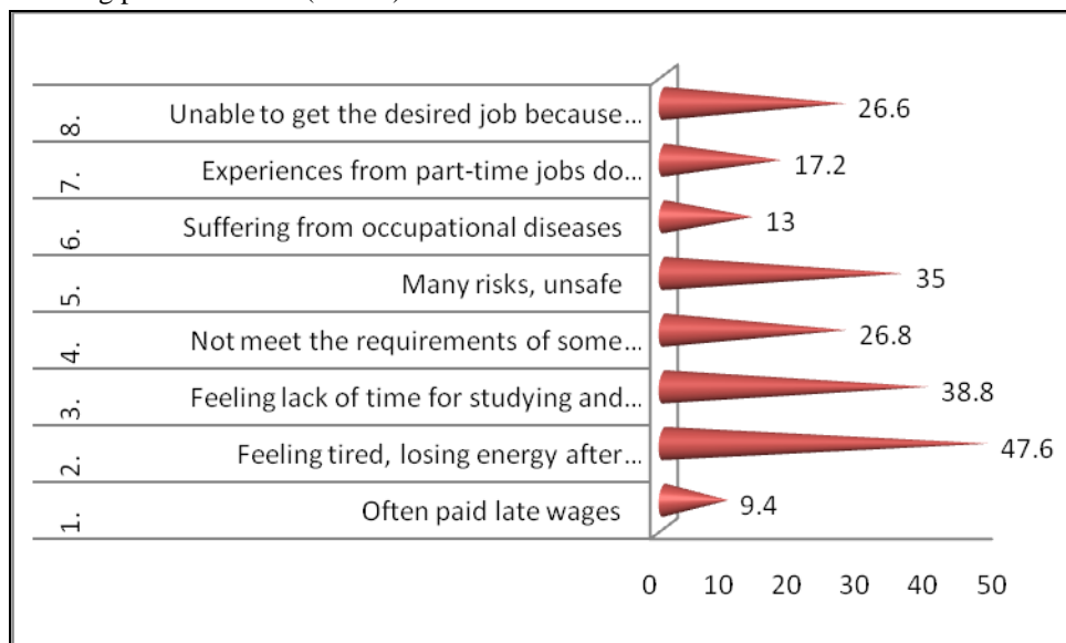
Figure 3: Difficulties during part-time work (unit:%)